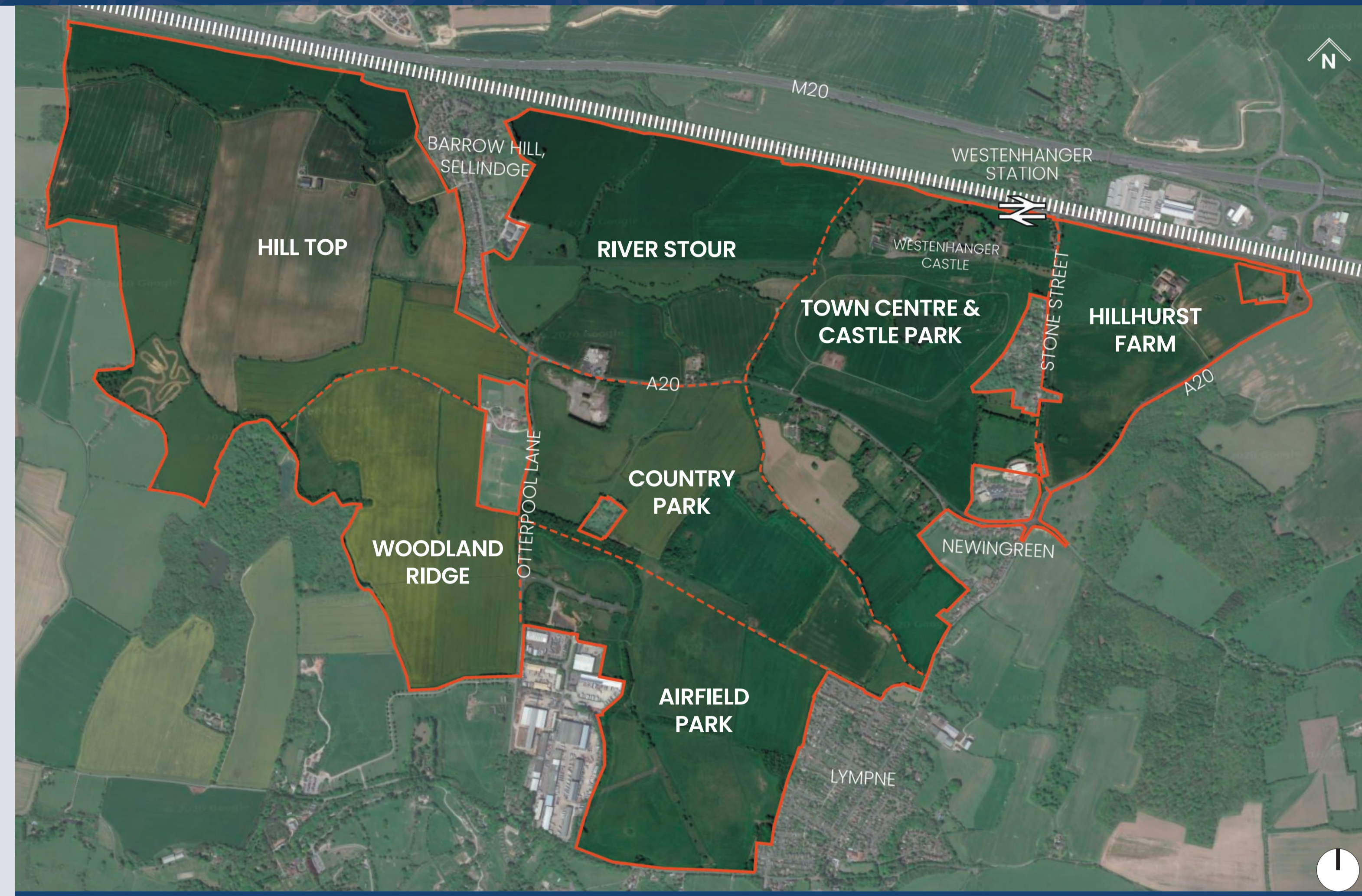
The seven character areas of Otterpool Park will have their own identities

This will ensure that there is a coordinated design approach across the whole town and consistently high-quality design.